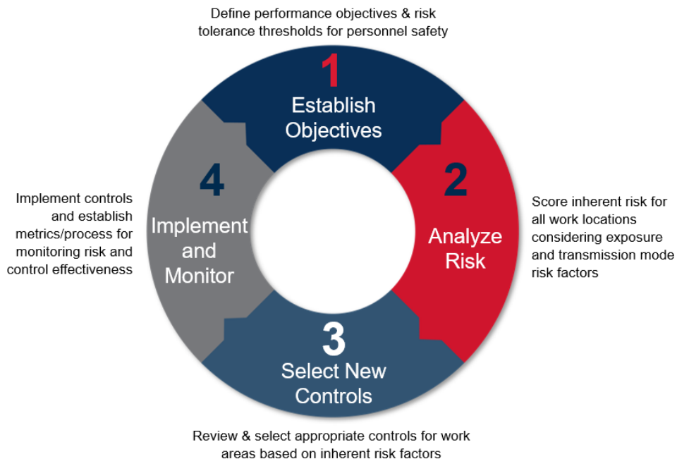
FIGURE 1 Risk Management Cycle

The cycle has proven to be effective for prioritizing risks and weighing the value of alternate risk-mitigation strategies. The process organizes information about the possibility of a spectrum of unwanted outcomes into an inclusive, orderly structure that helps decision makers to make more informed choices about their organization's ability to reduce risks. For marine and offshore assets, reference can be made to ABS Guidance Notes on Risk Assessment Applications for the Marine and Offshore Industries .