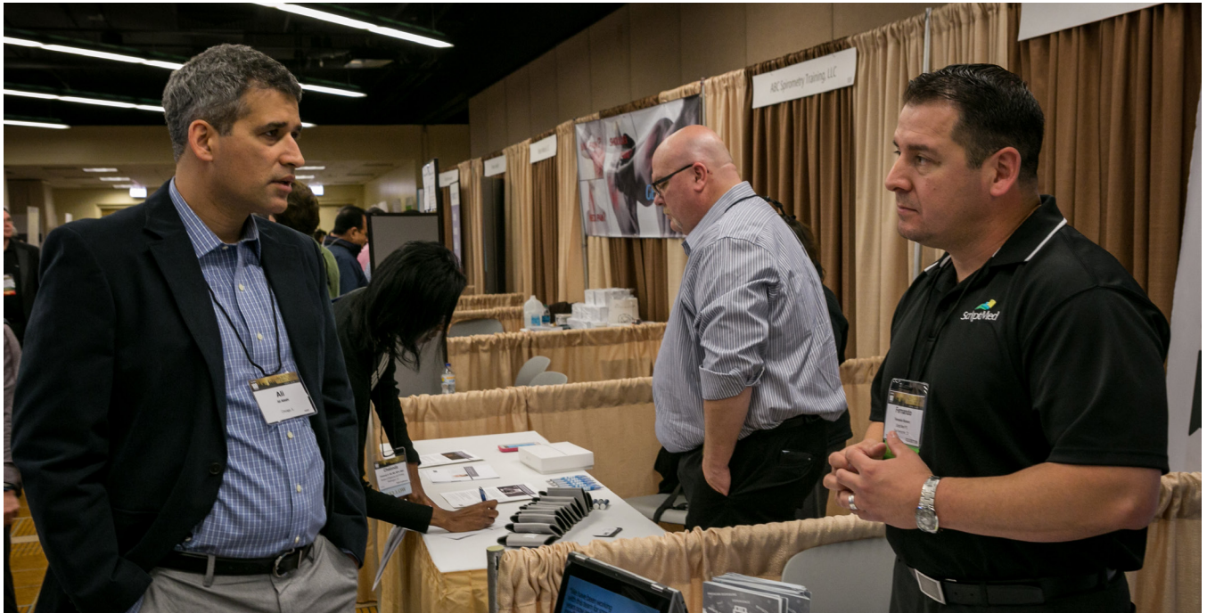
Exhibit Hall Hours & Highlights